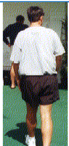
Who is this?