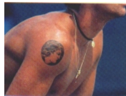
Who is this? Answer on page 3