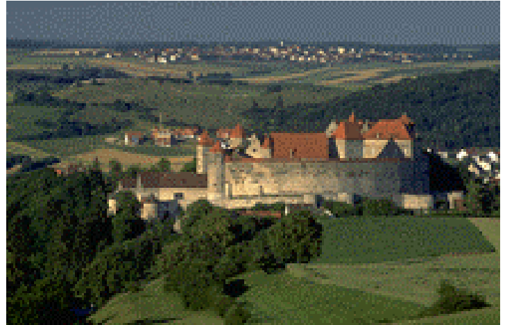
Chateau Genio, site of this year's holiday party!

As treasurer for the San Diego Tennis Federation, I take great pride in the fact that we serve members of the Gay & Lesbian community. Helping the organization meet that goal is my paramount concern. I will work hard to keep expenses at a minimum level to allow for more funding of events that directly benefit members. One of those changes has been to provide tennis balls for Friday Night Doubles. Some of our other expenses are funding and maintaining a WEB page, the monthly newsletter, annual Christmas party, Grand Prix awards and trophies for performance, participation and drama.