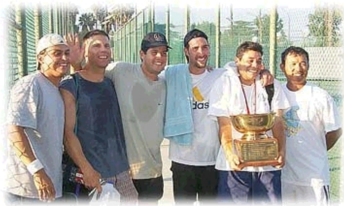
Members of San Diego's Cal Cup Team relax after the tournament. Join them in 2001!